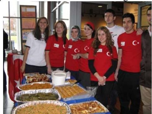
Turkish students at Howard Community College's "Arts Around the World"

Today, there are so many competing activities and organizations, that our role has changed. Rather than compete, we must change our operational model, and work with these many organizations. I look forward to hearing your ideas at our annual meeting.