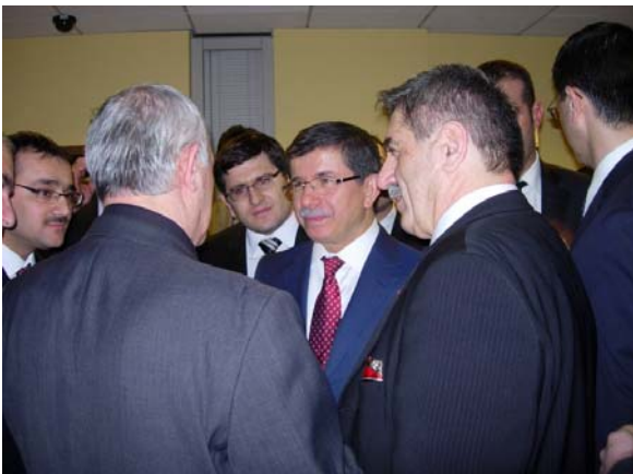
Ahmet Davutoglu (Turkish Foreign Minister) at reception of Alliance of Turkic Associations in Washington DC

Recently Turkish Foreign Minister Ahmet Davutoglu visited Washington D.C. and met with officials such as Secretary of State Hillary Clinton.